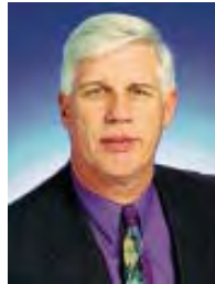
Larry Gamblin Security