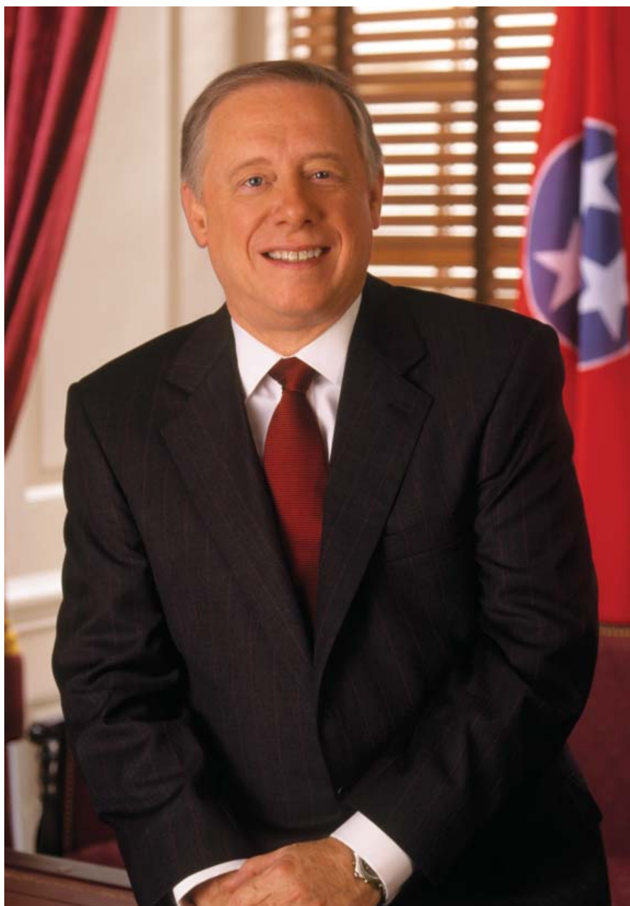
PHIL BREDESEN Governor